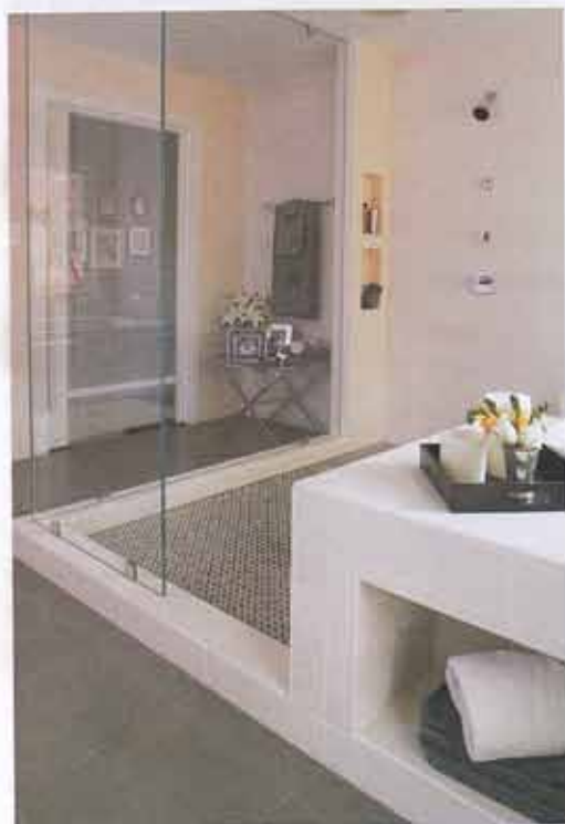
Lori Graham integrated the tub and shower (top and above). The vanity countertops (right) are poured concrete.