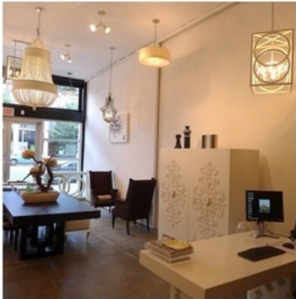
A sliding "barn door" can be moved to change the feel of the showroom space.