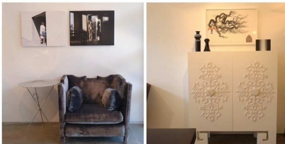
Furniture by Shine by SHO rests beneath Contemporary Wing-curated pieces.