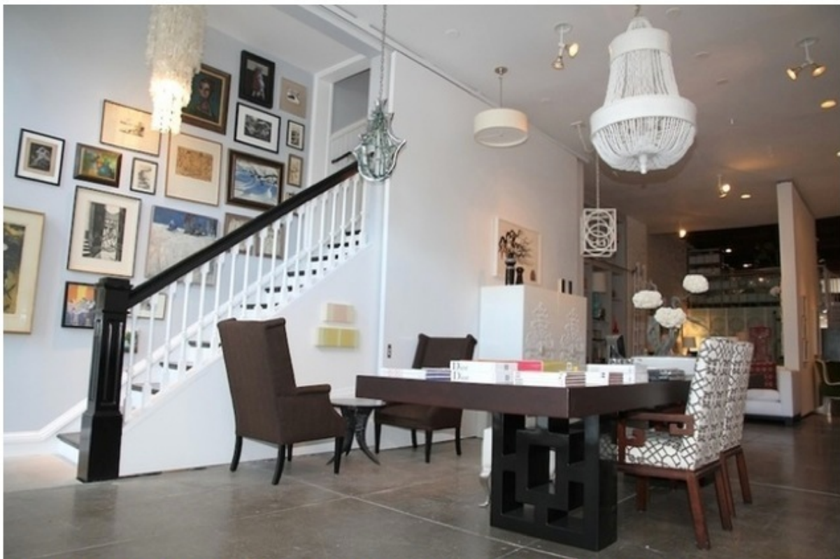
The building's first floor contains 1,700 feet of showroom space.

Collaboration and curation abound at local designer Lori Graham's new showroom on 14th Street, opening tomorrow. By Kathleen Bridges